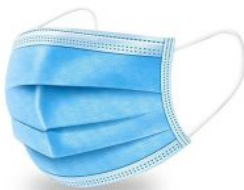
FACE MASK (50 PER BOX) Variations View All Price: Login to See Prices