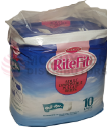
LASCO RITEFIT ADULT PULLUPS LG 8X10S (SOLD BY CASE) Price: Login to See Prices