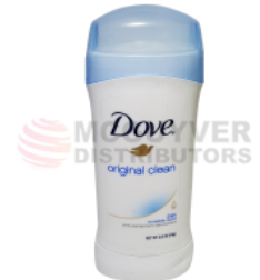
DOVE ORIGINAL CLEAN Price: Login to See Prices