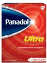
PANADOL ULTRA TABLET 104'S (SOLD PER BOX) Price: Login to See Prices