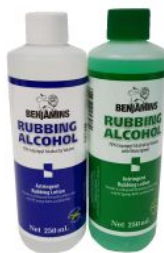
BENJAMIN RUBBING ALCOHOL 250ML - PER CASE (24PCS) Price: Login to See Prices