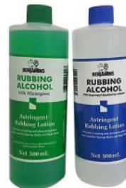
BENJAMIN RUBBING ALCOHOL 500ML - PER CASE Price: Login to See Prices