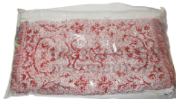
BATHING RAG Price: Login to See Prices