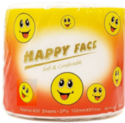
HAPPY FACE TISSUE (24 IN CASE) Price: Login to See Prices