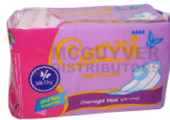
CURVES MAXI PAD 30X10 SILK DRY OVERNIGHT Price: Login to See Prices