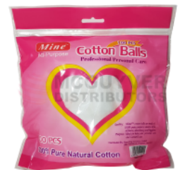
MINE COTTON BALLS (SOLD PER DOZEN) Price: Login to See Prices