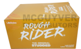
ROUGH RIDER CONDOM - 48 PER BOX Price: Login to See Prices