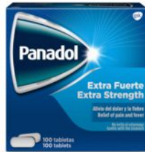
PANADOL 500 EXTRA STRENGTH (PER BOX)