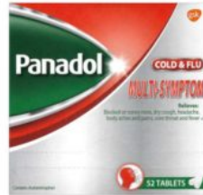
PANADOL MULTISYMPPTOM COLD & FLU (2BOXES)