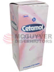
CETAMOL MENSTRUAL (SOLD BY BOX)