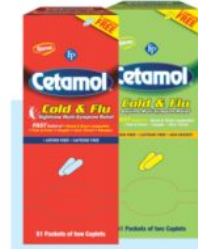
CETAMOL COLD AND FLU (SOLD BY BOX)