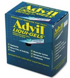
ADVIL LIQUID GELS - 50 PACKS X 2 TABLETS (BOX)